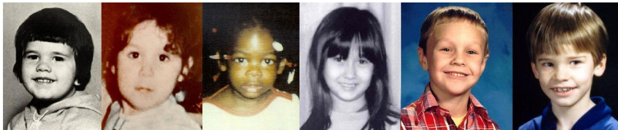
Long-term Missing – Please visit www.childfindofamerica.org for updated composites and posters of these and other missing children.