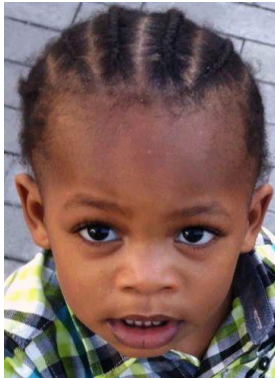
King Walker Gary, IN

*Age progressions/composites courtesy of NCMEC