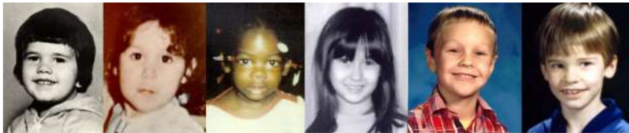
Long-term Missing – Please visit www.childfindofamerica.org for updated composites and posters of these and other missing children.